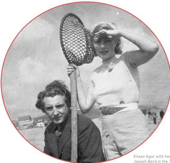
Eileen Agar with her husband, Joseph Bard in the 1930s. From the Archives and Access Project. © Tate

Tate is a charitable institution that holds the United Kingdom's national collection of British art from 1500 to the present day, as well as international modern and contemporary art. It comprises a network of four galleries: Tate Britain, Tate Liverpool, Tate St Ives and Tate Modern, as well as a web presence, Tate Online.