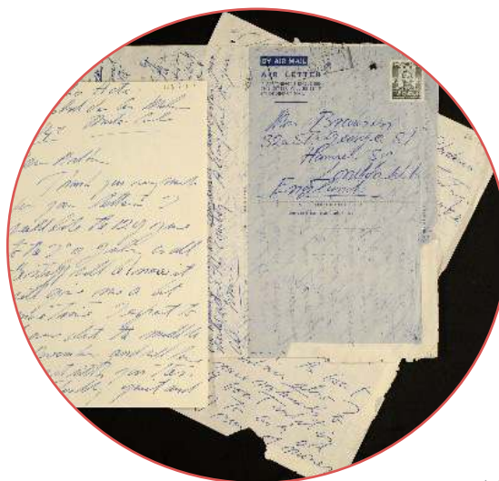
Letters of Francis Bacon. From the Archives and Access Project.